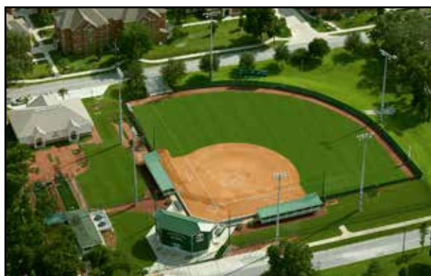
Patricia Wilson Field - Softball