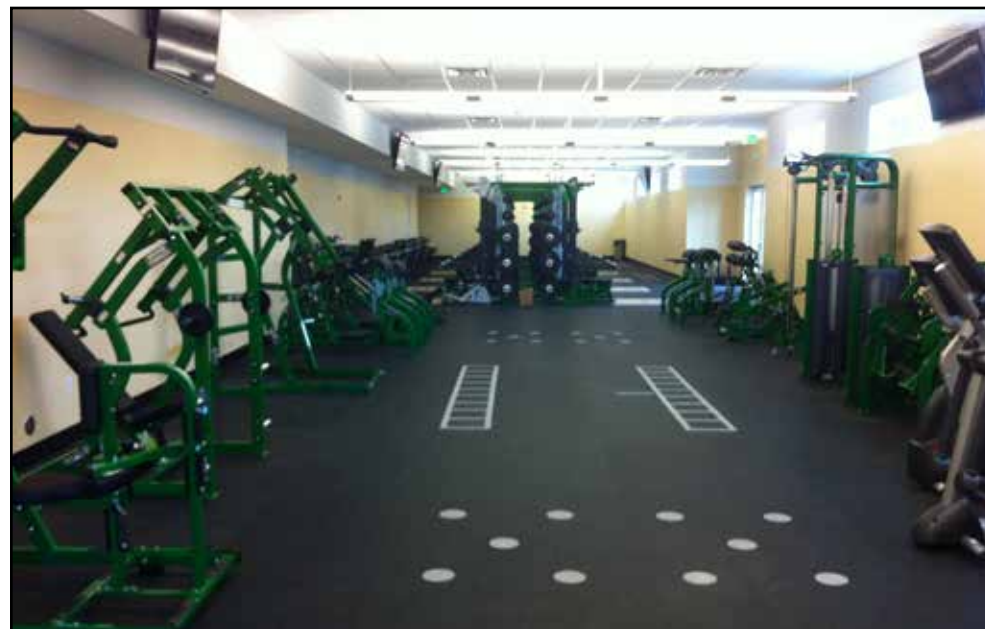
Stetson's Strength and Conditioning Facility at the Athletic Training Center