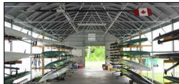
International Rowing Center