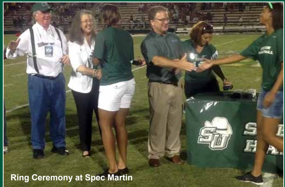
Ring Ceremony at Spec Martin