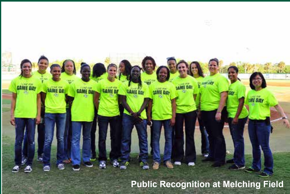
Public Recognition at Melching Field