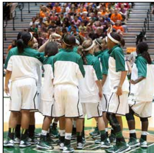
Stetson set school-records for most wins in a single-season (24), most wins in a two-year (47), three-year (67), and four-year period (73).