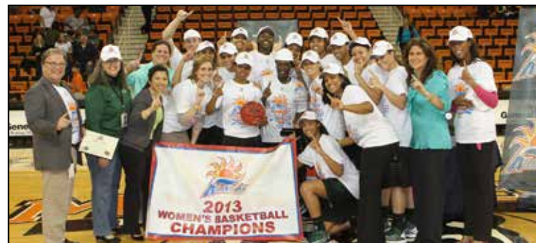
Stetson won the Atlantic Sun Conference Championship in 2011 (top) and 2013 (bottom).