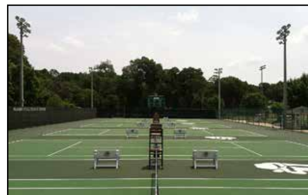
Mandy Stoll Tennis Center