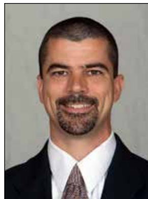
Jamie Bataille Athletic Communications