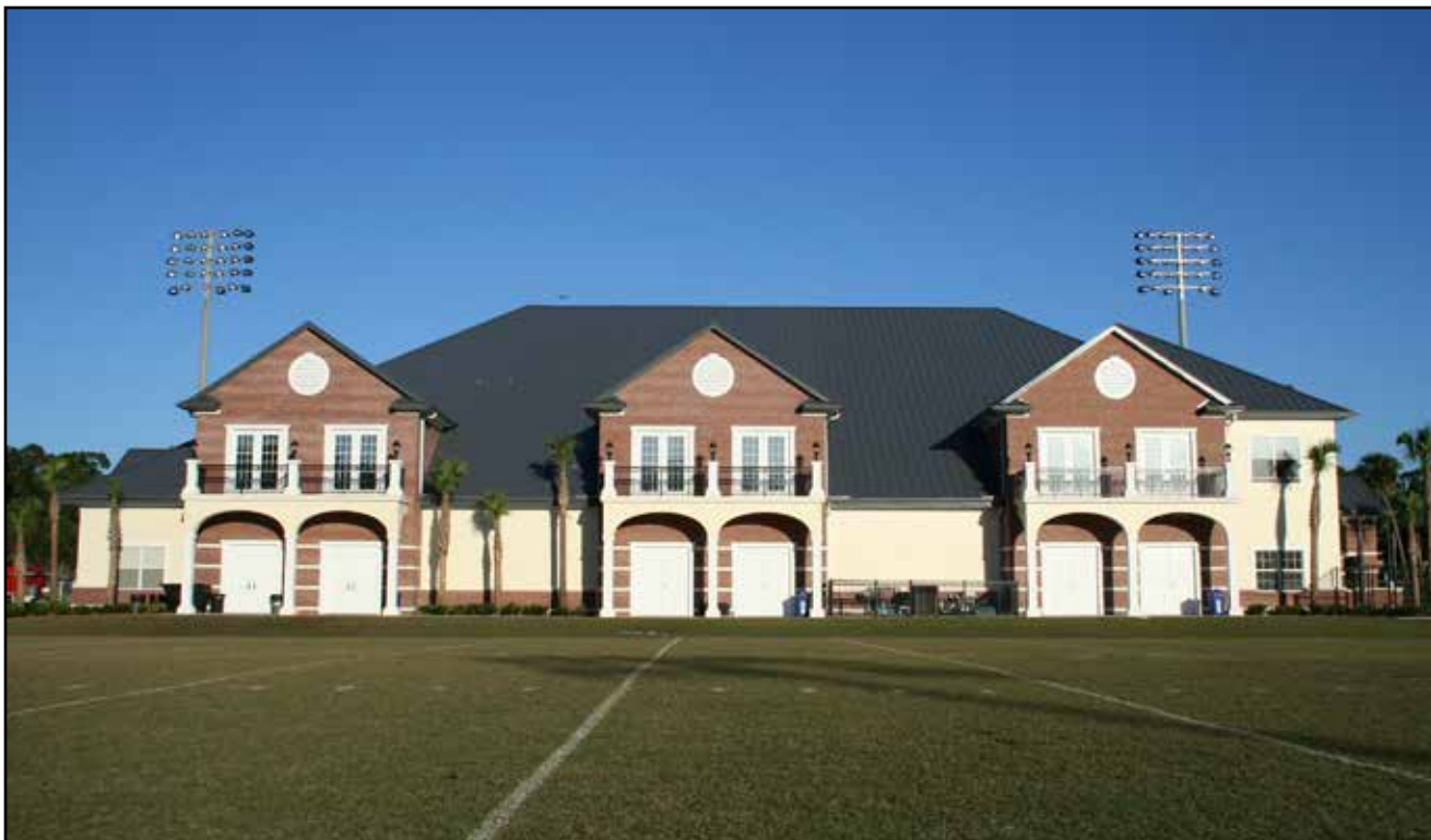
Athletic Training Center