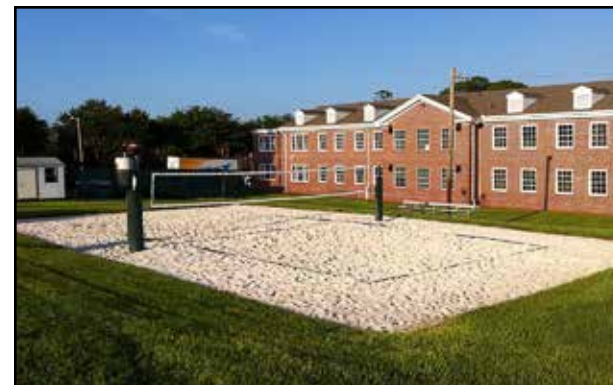
Sand Volleyball Courts