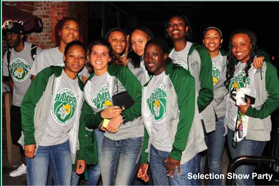
Selection Show Party