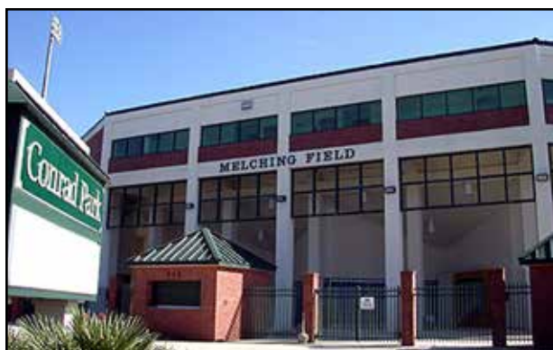
Melching Field - Baseball